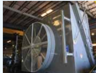
Optional EH Integrated Shipping design allows "face-down" transport