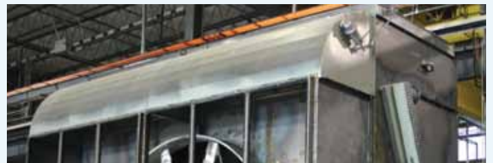
Optional warm air recirculation system