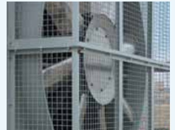
Optional bug screen / lint screen